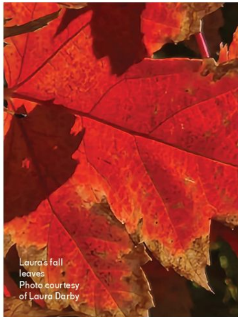
Laura's fall leaves