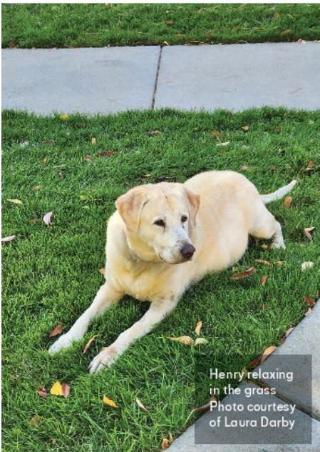
Henry relaxing in the grass