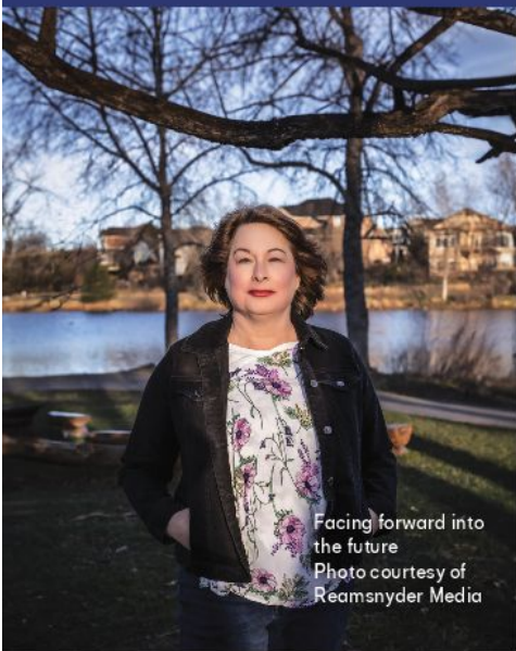
Facing forward into the future