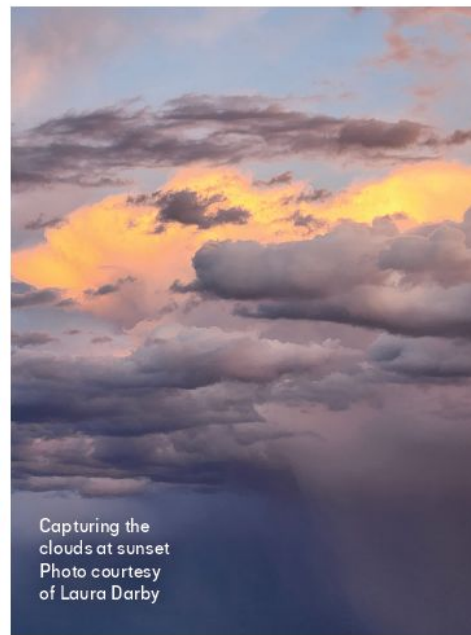
Capturing the clouds at sunset