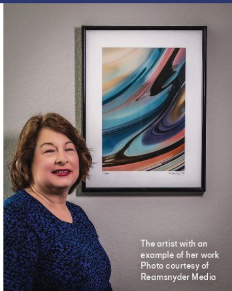
The artist with an example of her work