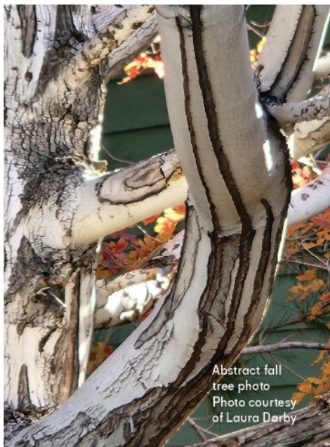
Abstract fall tree photo